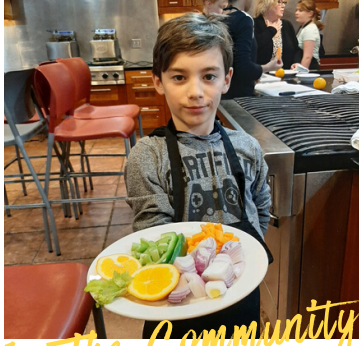
In The Community