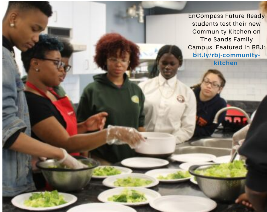
EnCompass Future Ready students test their new Community Kitchen on The Sands Family Campus. Featured in RBJ: bit.ly/rbj-community-kitchen

300 EnCompass students are learning this summer at sites throughout the community. See what they're up to on f @encompassresources